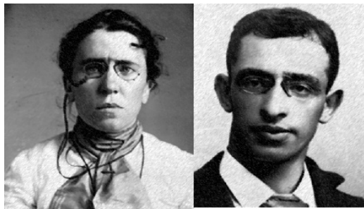
Emma Goldman and Alexander Berkman

The systematic man-hunt of anarchists [...] with the result that every prison and jail in Soviet Russia filed [sic] with our comrades, fully coincided in time and spirit with Lenin's speech at the Tenth Congress of the Russian Communist Party. On that occasion Lenin announced that the most merciless war must be declared against what he termed "the petty bourgeois anarchist elements" which, according to him, are developing even within the Communist Party [...] On the very day that Lenin made the above statement, numbers of anarchists were arrested all over the country, without the least cause or explanation. The conditions of their imprisonment are exceptionally vile and brutal. (Boni, 253)